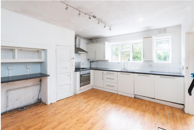
Chart Lane South, RH5

Chart Lane South is located on the edge of the historic market town of Dorking, close to many fantastic amenities including a 15-minute walk into Dorking shopping centre, endless beautiful countryside and a 3-minute walk from Dorking golf club, perfect for any budding golfers. Another notable amenity is the stunning lottery funded Deepdene Trail & Hope Mausoleum which is ideal for exciting family walks. Dorking mainline train station is an 8-minute cycle ride away, with direct links to London in under 1 hour making it a great location for commuters. A short 5-minute stroll down the road is the charming Royal Oak pub which has exceptional views across fields, ideal for an evening meal or drink. Also close by is a convenience store and two recreation grounds with children's play areas.