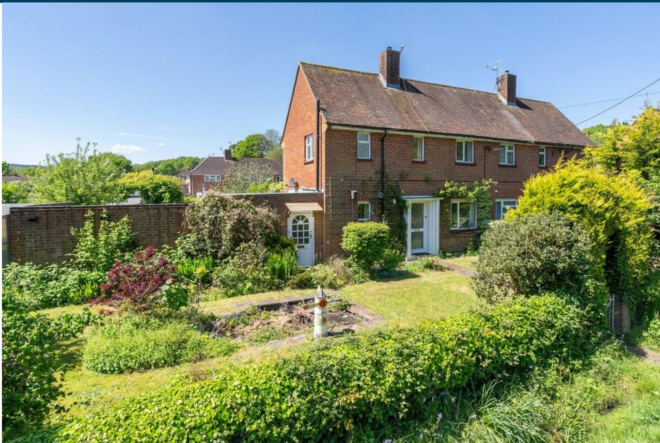
Chart Lane South