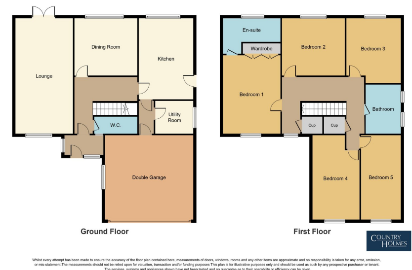
ms and appliances shown have not been tested and no guarantee as to their operability or

Country Holmes offers to market with NO CHAIN is this FIVE-DOUBLE BEDROOM detached situated on a sizeable plot enjoying gardens to both front side and rear. The property is on a desirable road and has fantastic views with ample off-road parking and an integral garage. The internal accommodation spans over 2000 square feet and in brief comprises; a uPVC porch leading to a spacious entrance hall leading to all ground floor accommodation, lounge which runs the full length of the house overlooking the rear garden, dining room, kitchen with granite worktops, utility room and downstairs WC. On the first floor are five double bedrooms, a family bathroom and an en suite shower room in the master bedroom. Externally the property has well-tended gardens to front and rear, a labour of love for the sellers over many years which are planted with an array of flowers and shrubs, a large lawn with a patio area