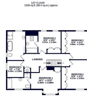
1ST FLOOR 1038 sq.ft. (96.4 sq.m.) approx.