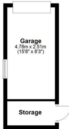
Ground Floor Approx. 56.4 sq. metres (607.0 sq. feet)