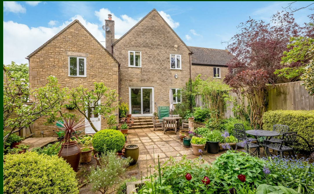
1 Church Street Charlbury Oxfordshire OX7 3PW Telephone: 01608 811146