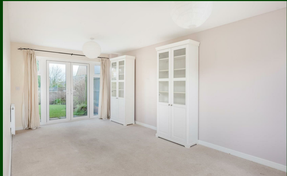
1 Church Street Charlbury Oxfordshire OX7 3PW Telephone: 01608 811146