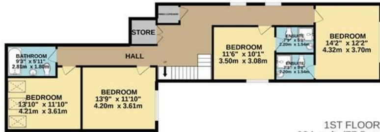
1ST FLOOR 834 sq.ft. (77.5 sq.m.) approx.