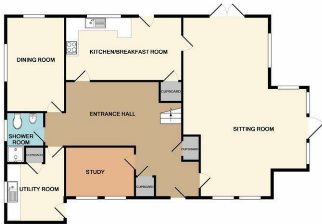
GROUND FLOOR APPROX. FLOOR AREA 1249 SQ.FT. (116.1 SQ.M.)