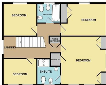
1ST FLOOR APPROX. FLOOR AREA 778 SQ.FT. (72.3 SQ.M.)

TOTAL APPROX. FLOOR AREA 2027 SQ.FT. (188.4 SQ.M.) Whilst every attempt has been made to ensure the accuracy of the floor plan contained here, measurements of doors, windows, rooms and any other items are approximate and no responsibility is taken for any error, omission, or mis-statement. This plan is for illustrative purposes only and should be used as such by any prospective purchaser. The services, systems and appliances shown have not been tested and no guarantee as to their operability or efficiency can be given. Made with Metropix (2017)