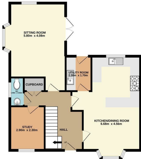
GROUND FLOOR 67.7 sq.m. approx.