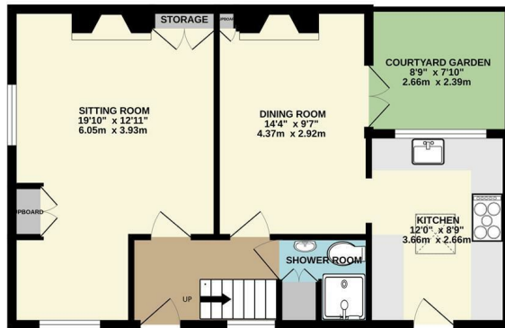
GROUND FLOOR 535 sq.ft. (49.7 sq.m.) approx.