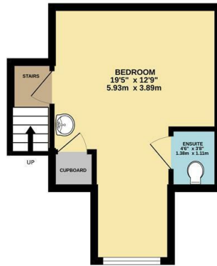
1ST FLOOR 232 sq.ft. (21.6 sq.m.) approx.