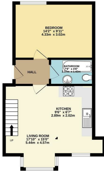
GROUND FLOOR 427 sq.ft. (39.7 sq.m.) approx.