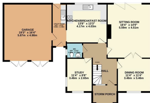
GROUND FLOOR 1256 sq.ft. (116.7 sq.m.) approx.