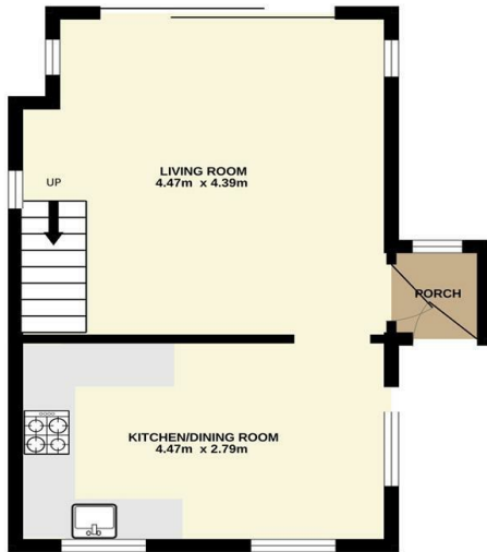
GROUND FLOOR 32.9 sq.m. approx.