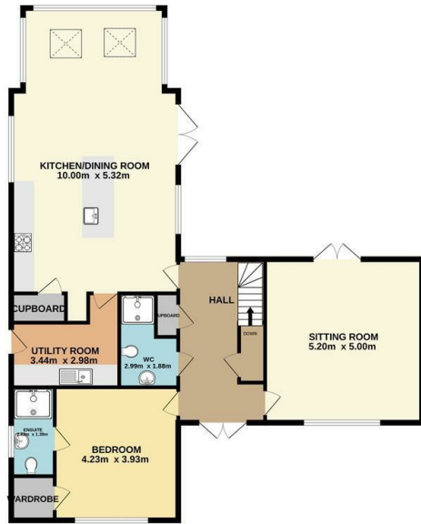
GROUND FLOOR 124.8 sq.m. approx.