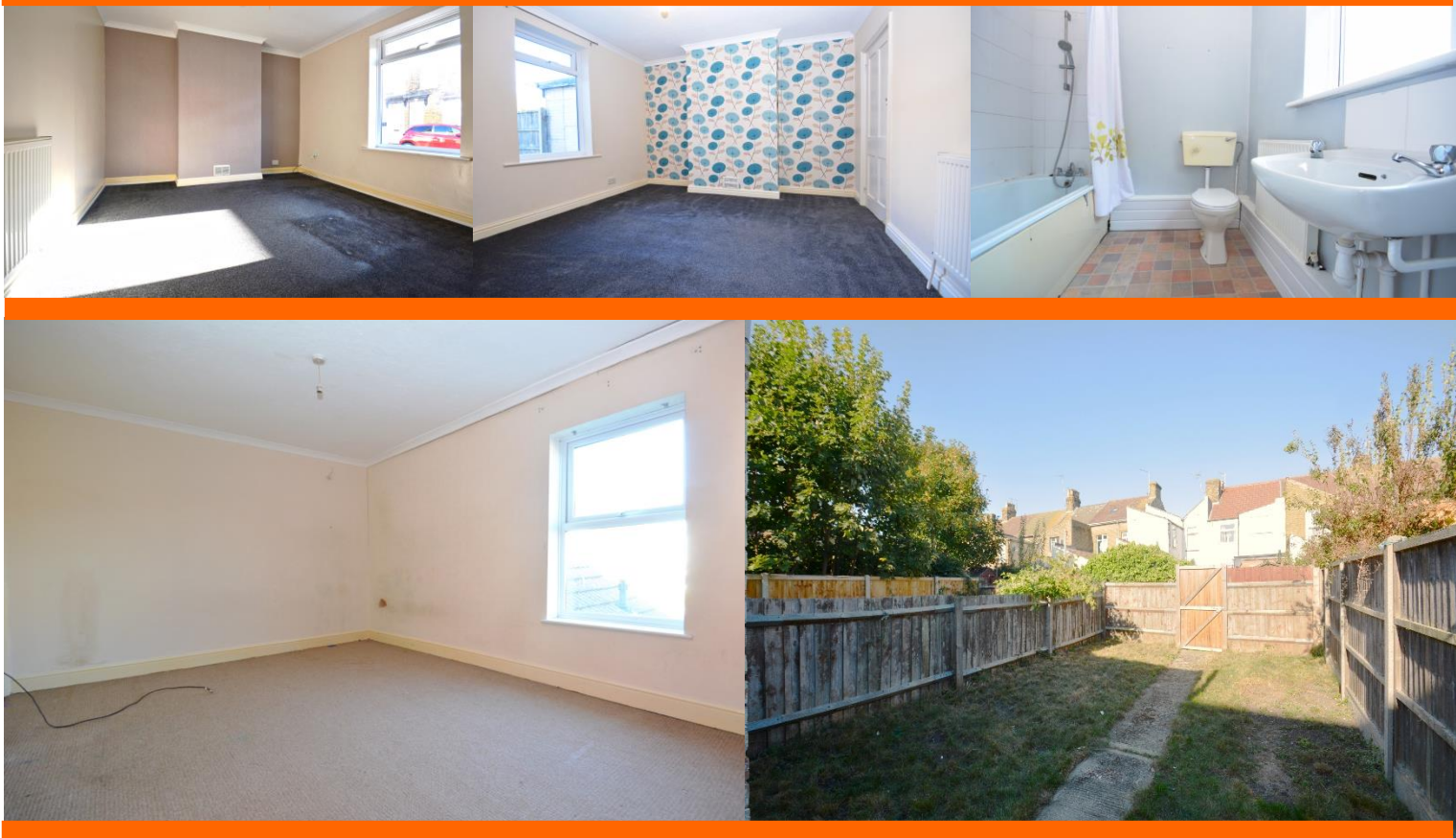
GROUND FLOOR 520 sq.ft. (48.3 sq.m.) approx.