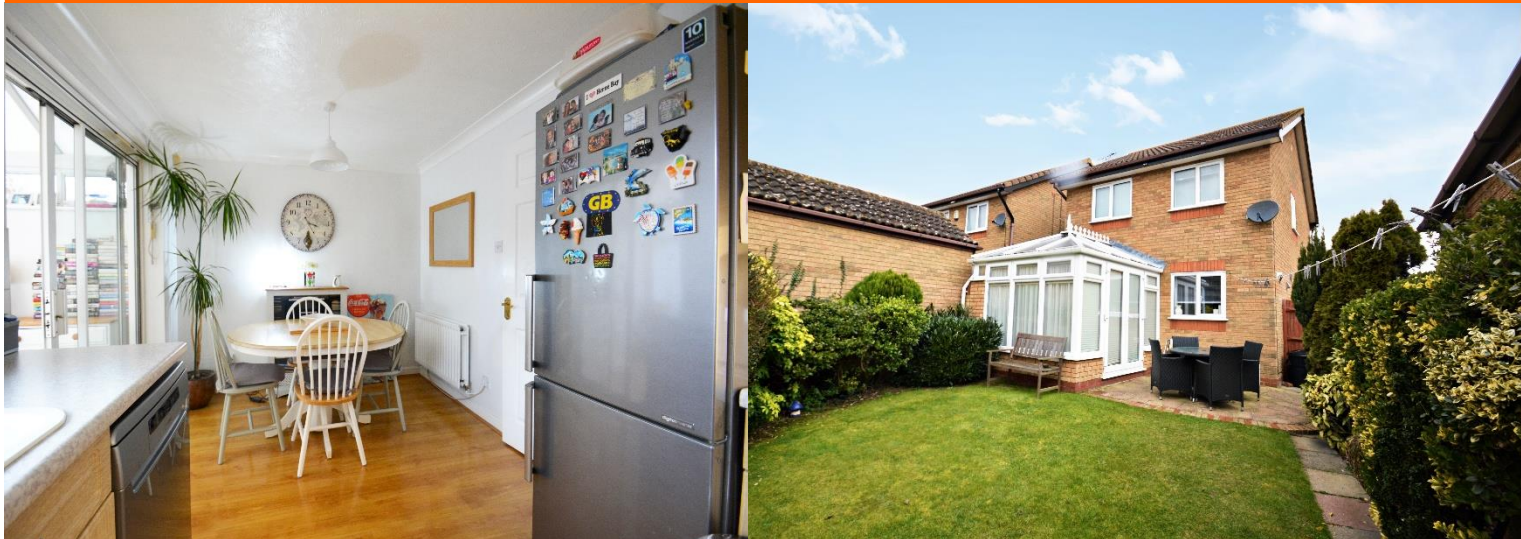
GROUND FLOOR 435 sq.ft. (40.4 sq.m.) approx.