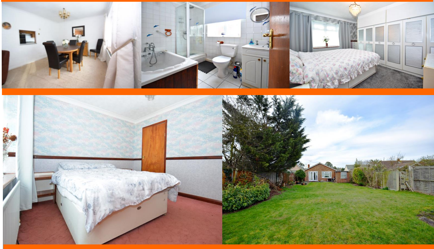
GROUND FLOOR 1189 sq.ft. (110.4 sq.m.) approx.