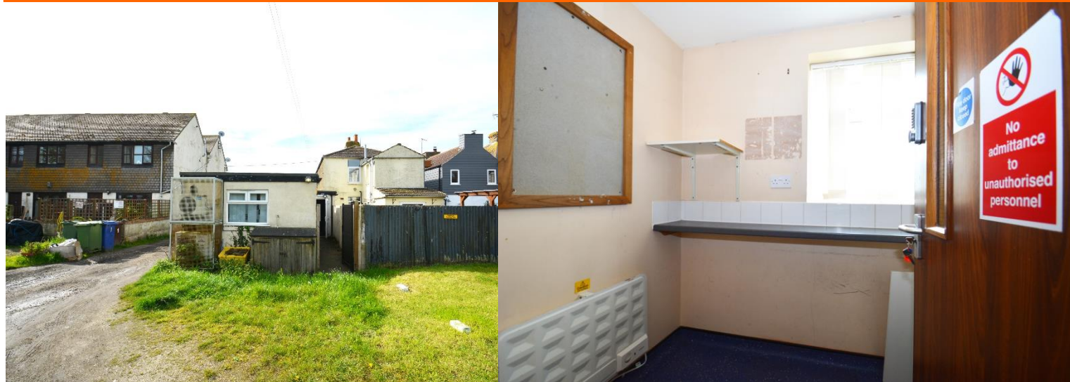
GROUND FLOOR 939 sq. ft. (87.2 sq.m.) approx.