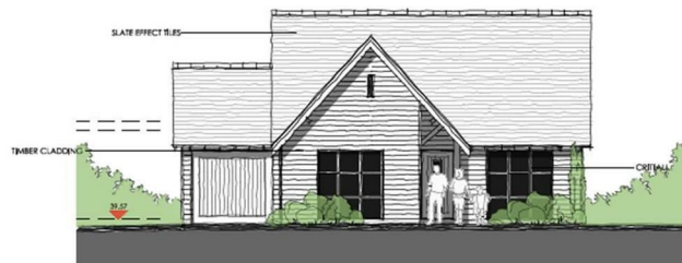
FRONT NORTH EAST ELEVATION SCALE: 1:100