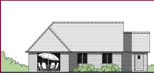
REAR SOUTH WEST ELEVATION SCALE: 1:100