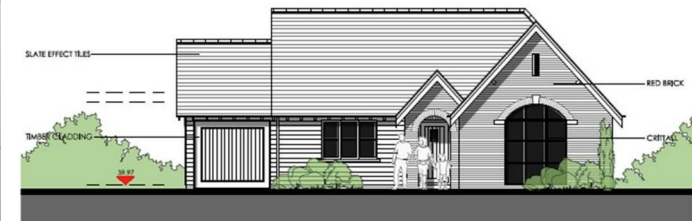
FRONT NORTH EAST ELEVATION SCALE: 1:100