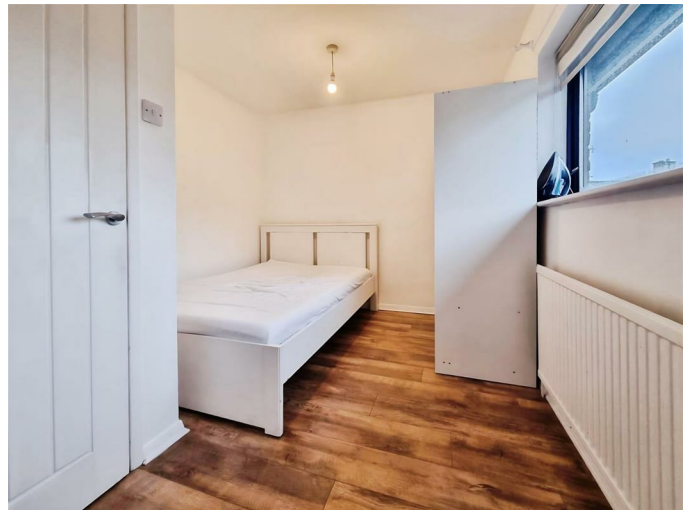
Bedroom Three 11'1 x 6'1 (3.38m x 1.85m)