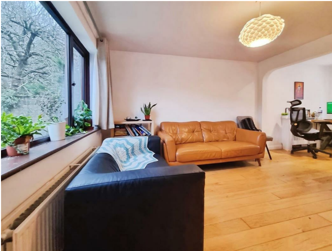
Lounge 12'0 x 11'4 (3.66m x 3.45m)