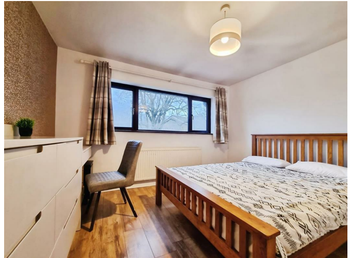
Bedroom Two 10'4 x 8'1 (3.15m x 2.46m)