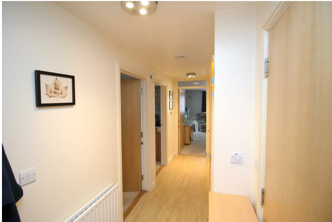
Living Room 15'11 x 14'4 (4.85m x 4.37m)