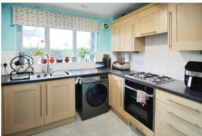
Fitted Kitchen 9'9 x 7'6 (2.97m x 2.29m)