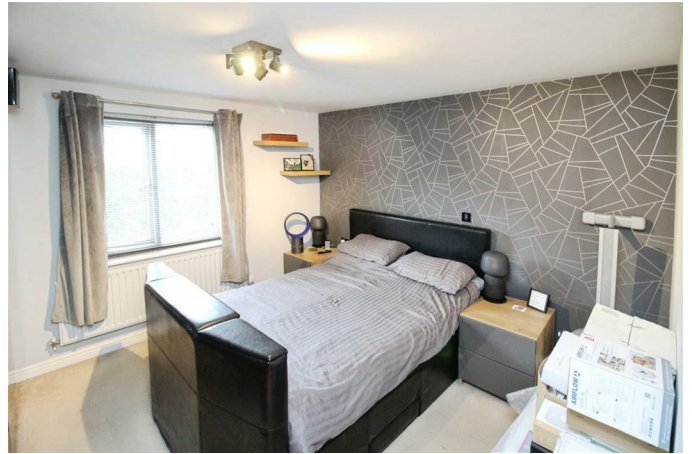
Bedroom Two 11'2 x 10'4 (3.40m x 3.15m)