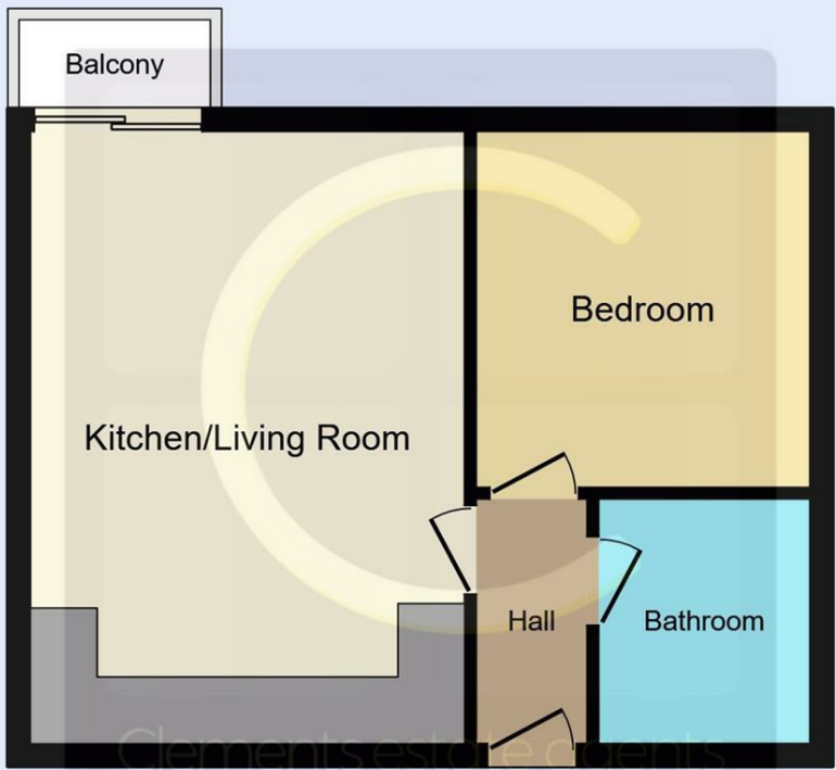
Floor Plan Floor area 38.5 m 2 (414 sq.ft.)