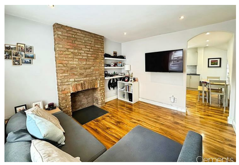
Glenview Road, Boxmoor, Hemel Hempstead, HP1 1TB Asking Price £325,000

Located in highly sought after Boxmoor is this character split level flat. Boasting two bedrooms, 12'0 living room, 12'1 x 11'0 modern fitted kitchen/breakfast room, utility room, double glazing, gas central heating, newly fitted bathroom suite, private rear garden and allocated parking. Situated within easy reach of Hemel Hempstead train station and the M1, M25 and A41 road links.