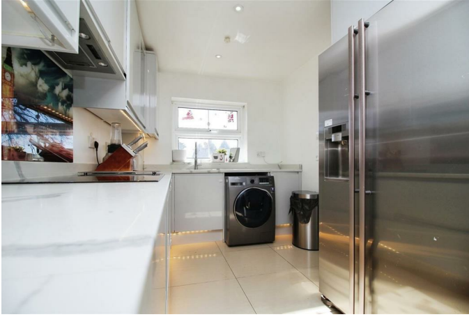
MAIN KITCHEN 12'8 x 7'9 (3.86m x 2.36m)