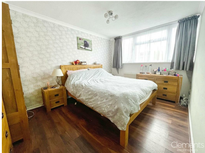
Bedroom One 13'00 x 9'04 (3.96m x 2.84m)

Double glazed window to front aspect, wood laminate flooring, coving to ceiling and radiator.