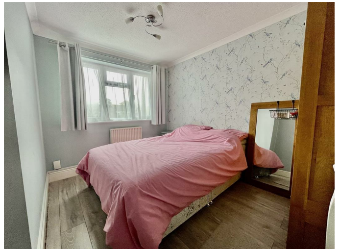
Bedroom Two 9'05 x 10'09 (2.87m x 3.28m)

Double glazed window to rear aspect, coving to ceiling and radiator.