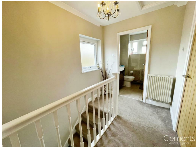
Landing 8'03 x 6'03 (2.51m x 1.91m)

Frosted double glazed window to side aspect, coving to ceiling and radiator, doors to all three bedrooms and bathroom.