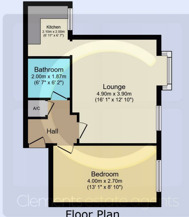
Floor Plan Floor area 47.5 m 2 (511 sq.ft.)