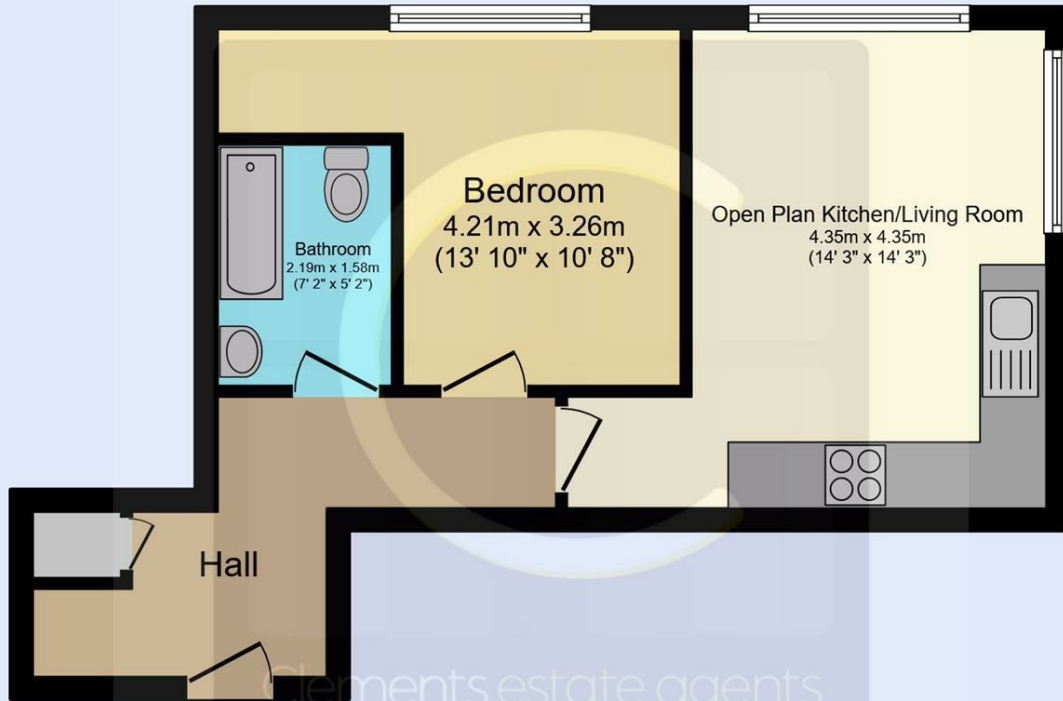
Floor Plan Floor area 36.7 m 2 (395 sq.ft.)