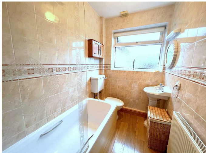
Bathroom 8'1" x 4'11" (2.46 x 1.50)

Having a white suite which comprises a panelled bath with Triton shower fitment, low level lavatory, pedestal wash hand basin, single radiator, fully tiled walls, uPVC obscured double glazed window to the rear aspect and laminate flooring.