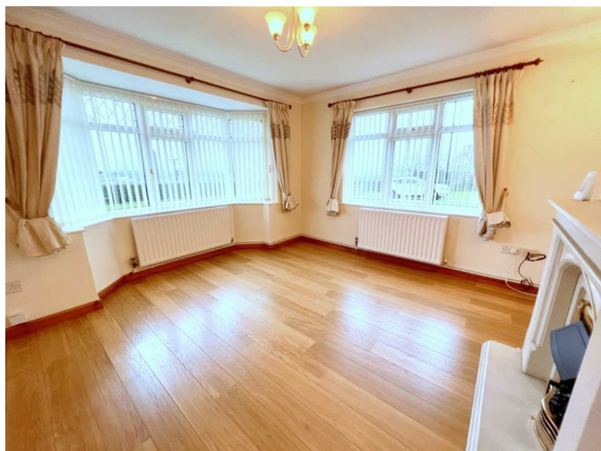
Sitting Room 14'0" x 11'11" (4.26 x 3.64)

Having a feature fireplace with with log burner and laminate floor.