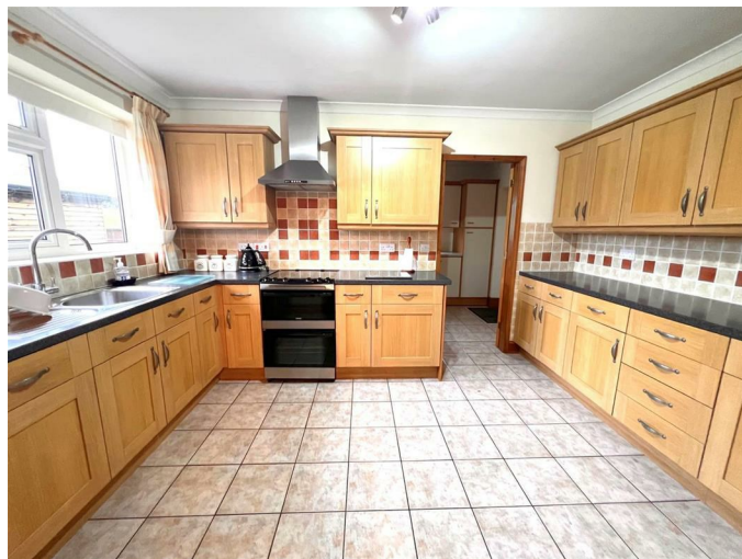
Kitchen 13'0" x 11'1" (3.97 x 3.38)

Having an excellent range of units, plumbing for a dishwasher, roll top worktops with inset stainless steel sink and mixer tap, NEFF extractor fan, matching wall cupboards, single radiator, uPVC double glazed window to the side aspect and tiled floor.