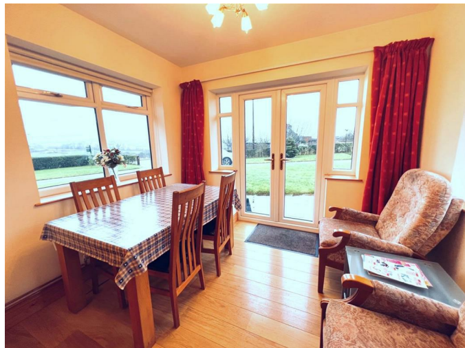
Conservatory 9'5" x 7'10" (2.88 x 2.38)

With a pair of uPVC double glazed patio doors to the side aspect, uPVC double glazed window to the front and rear aspect and laminate floor.