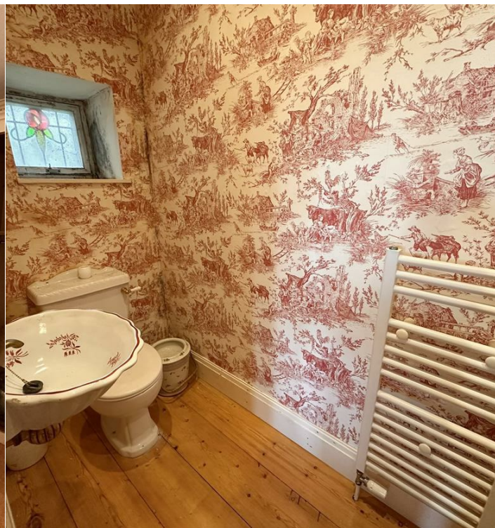
En-suite 9'8" x 7'6" max (2.96m x 2.30m max)

With wooden floor, radiator, fitted wardrobes and a UPVC double glazed window to rear aspect