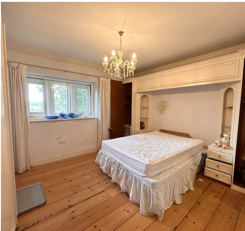
Bedroom Number Two 14'2" x 12'8" (4.32m x 3.88m)

With wooden floor, radiator, fitted wardrobes and a UPVC double glazed window to rear aspect