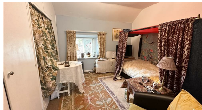
Bedroom Number Three 12'1" x 7'11" (3.69m x 2.43m)

With radiator, single glazed window to rear aspect and built in wardrobes