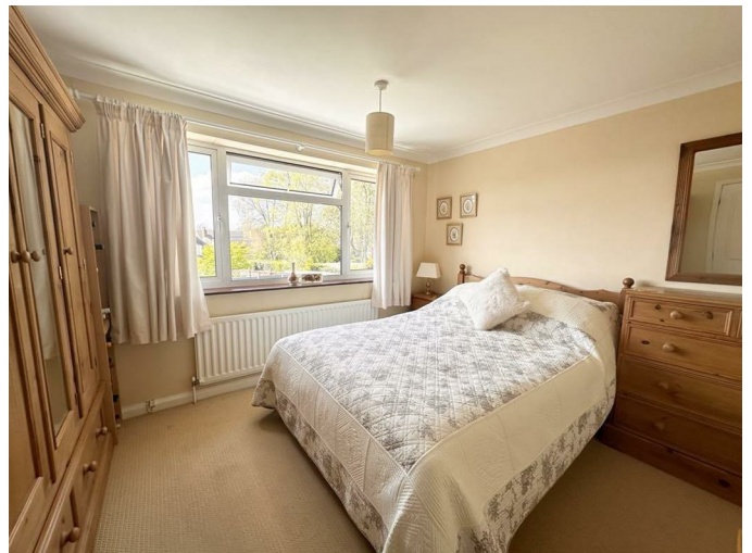
Bedroom Two 11'8" x 9'10" (3.58 x 3.0)

With UPVC double glazed window to the rear aspect and radiator.