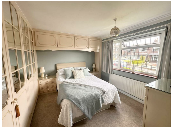
Bedroom One 11'11" x 11'1" (3.64 x 3.39)

Having a UPVC double glazed window to the front aspect, radiator and built in bedroom furniture.