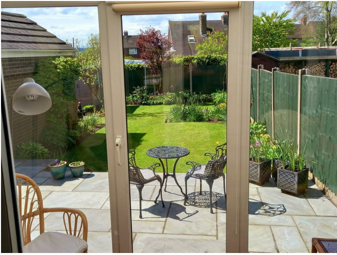
Dining Kitchen 15'10" x 9'3" (4.83 x 2.83)