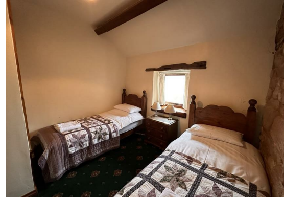
Bedroom Three - The Coach House 10'5" x 10'1" (3.18 x 3.09 )

Good sized double bedroom with window to front and side aspects, stone walls to part, wash hand basin, single radiator and built in wardrobe.