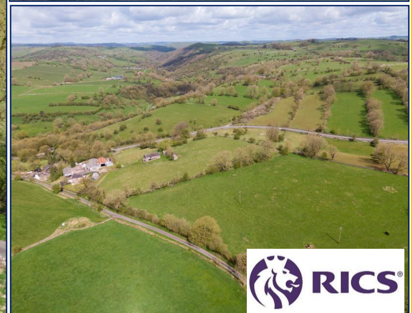
Stoney Rock Farm, Leek Road, Waterhouses, ST10 3LH