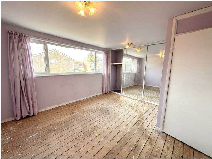
Master Bedroom 14'11" x 11'11" (4.57 x 3.64)

Having a double glazed picture window to the rear aspect, built in wardrobes with mirrored doors, double radiator.