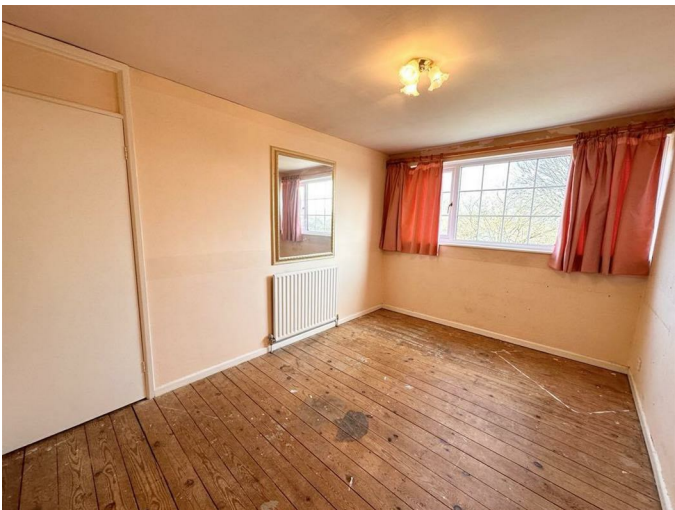
Bedroom Two 12'9" x 8'11" (3.91 x 2.72)

With double glazed picture window to the front aspect, radiator and built in wardrobes.