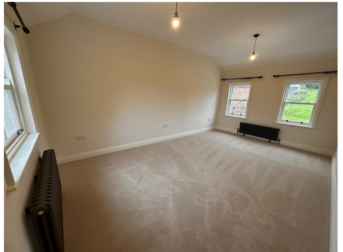
Master Bedroom 17'8" x 11'4" (5.41 x 3.47)

Double glazed sash windows to front and rear, antique radiator, loft access.