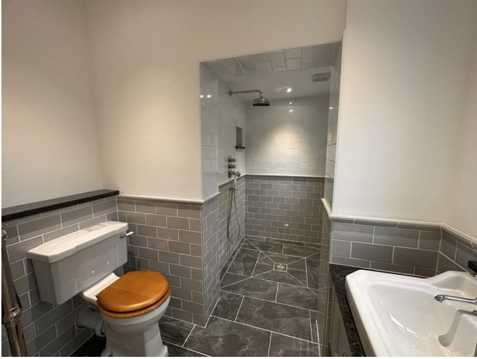
Shower Room 9'1" x 7'6" (2.78 x 2.31)

(Max measurement) Wet room incorporating mixer shower fitment, double glazed window to side, low level wc, wash hand basin, with cupboards beneath, double glazed window to side, heated towel rail, tiled floor with underfloor heating.