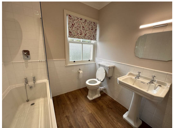
Bathroom 7'7" x 7'7" (2.33 x 2.32)

White suite comprising panelled bath with mixer shower over, low level wc, pedestal wash hand