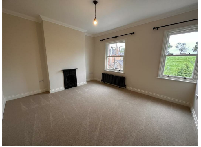
Bedroom Two 13'11" x 12'4" (4.26 x 3.76)

Two double glazed sash windows to front, antique radiator, ornamental fireplace.