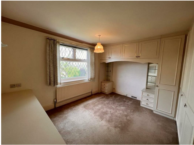
Bedroom One 12'6" x 11'5" (3.83 x 3.49)

With a double glazed window to the front aspect, single radiator and a range of bedroom furniture.