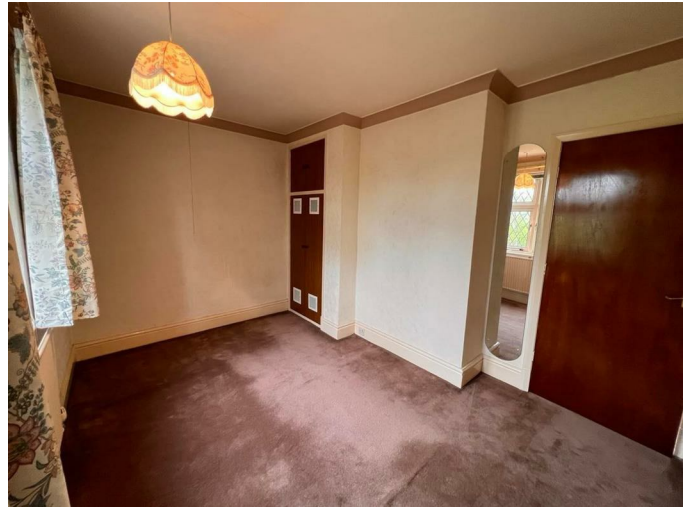
Bedroom Two 9'3" x 9'1" (2.83 x 2.78)

Having a double glazed window to the side aspect, single radiator, built in airing cupboard housing a Worester boiler.