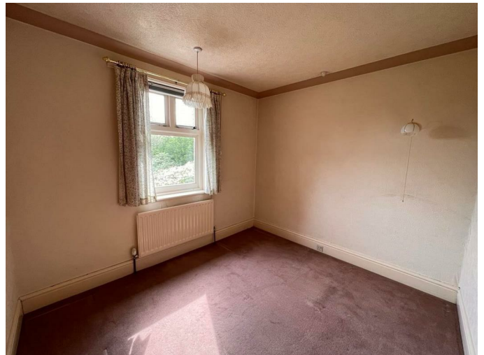
Bedroom Three 9'9" x 8'7" (2.99 x 2.64)

With double glazed window to the rear aspect and single radiator.