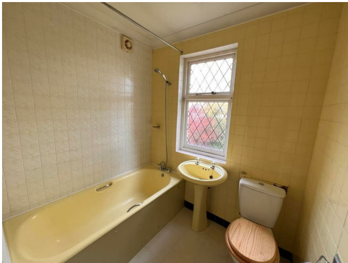
Bathroom 6'5" x 5'6" (1.98 x 1.68)

The bathroom provides a panelled bath with mixer taps and shower attachment, pedestal wash hand basin, low level lavatory, fully tiled walls, double glazed obscured window to the front aspect and double radiator.