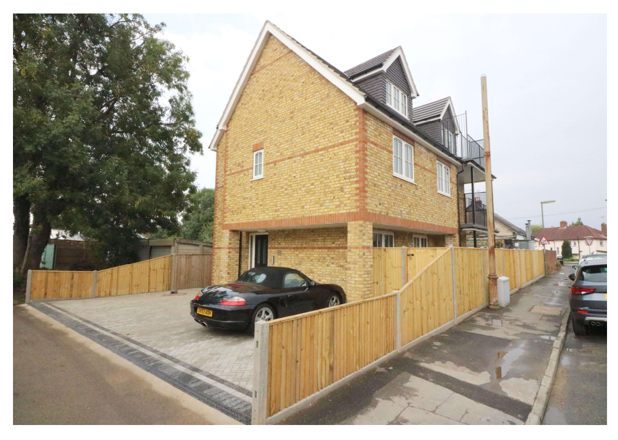
Glebe Road, Egham, Surrey, TW20 8BT £1,250 pcm Unfurnished