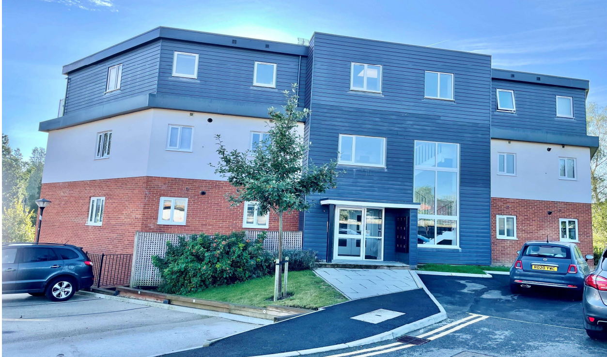
Robins Gate, Bracknell, RG12 9TA