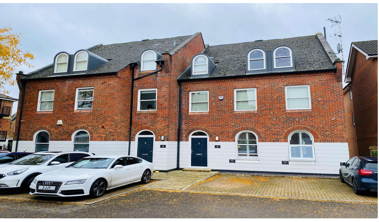
Gogmore Lane, Chertsey, Surrey, KT16 9GE