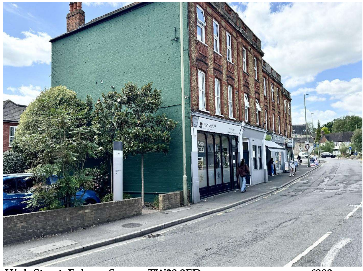
High Street, Egham, Surrey, TW20 9ED