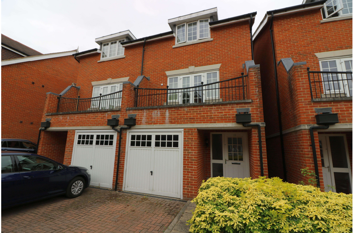
Brackendale Close, Surrey, TW20 0UL