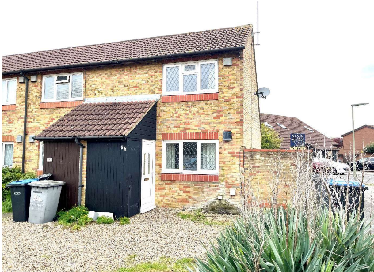
Alexander Road, Egham, TW20 8AE