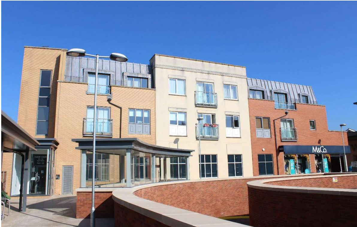
Church Road, Surrey, TW20 9HZ