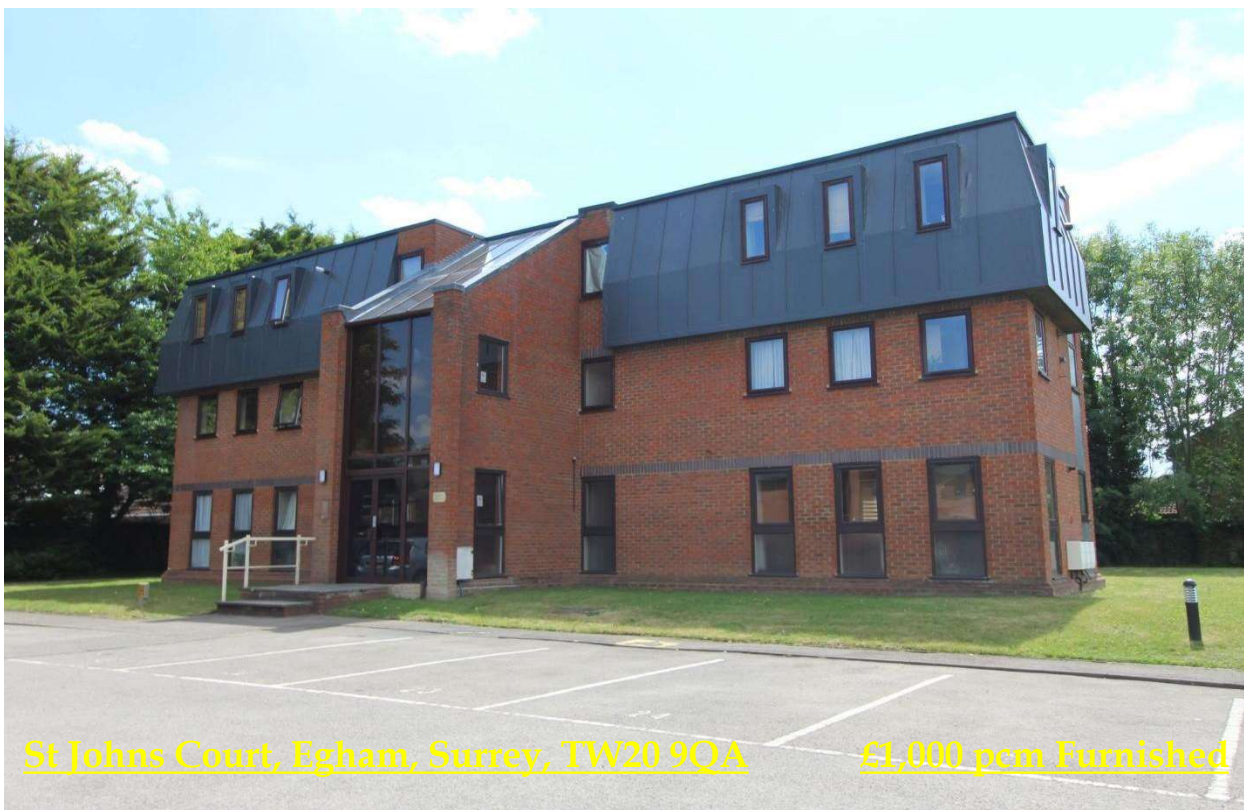
St Johns Court, Egham, Surrey, TW20 9QA