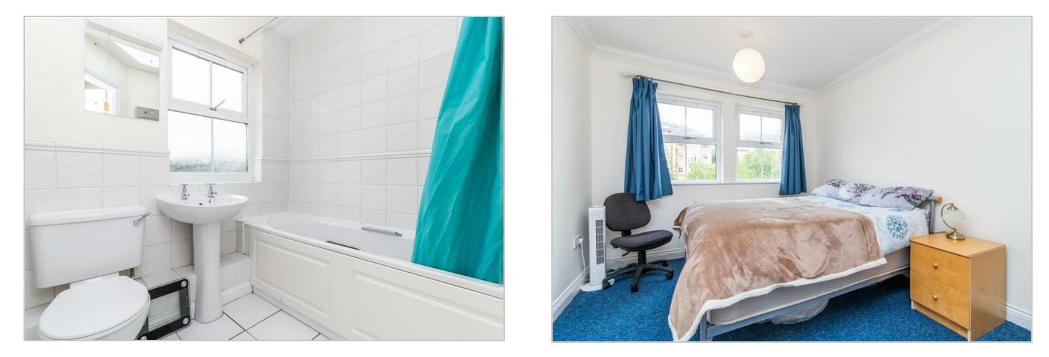
These particulars are intended to give a fair and reliable description of the property but no responsibility for any inaccuracy or error can be accepted and do not constitute an offer or contract. We have not tested any services or appliances (including central heating if fitted) referred to in these particulars and the purchasers are advised to satisfy themselves as to the working order and condition. If a property is unoccupied at any time there may be reconnection charges for any switched off/disconnected or drained services or appliances - All measurements are approximate. THINKING OF SELLING OR LETTING? If you are thinking of selling or letting your home or just curious to discover the value of your property, Hunters would be pleased to provide free, no obligation sales and marketing advice. Even if your home is outside the area covered by our local offices we can arrange a Market Appraisal through our national network of Hunters estate agents.

A modern 2 bed flat offered fully furnished comprising 2 bathrooms, living/dining room, fitted kitchen, communal gardens. Centrally located and very close to the Said Business School. Available 23rd Sept 2025. This flat does not come with parking.