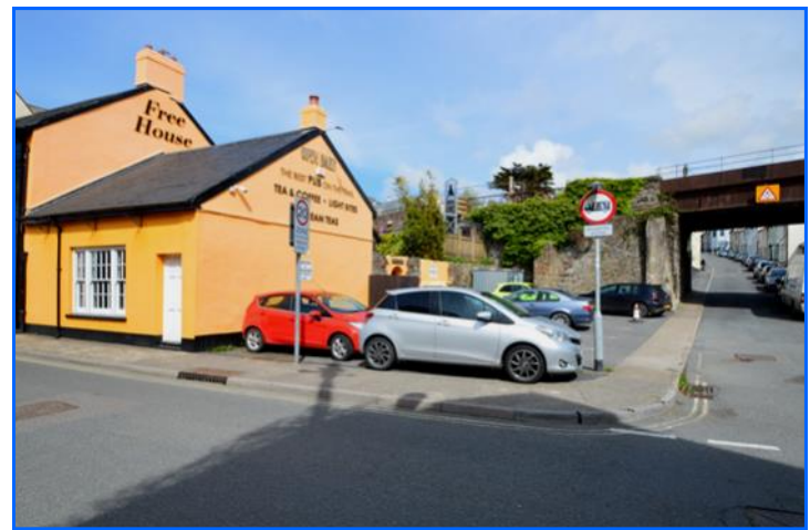
PUBLIC HOUSE, RESTAURANT AND BEER GARDEN LOCATED ALONGSIDE TARKA TRAIL