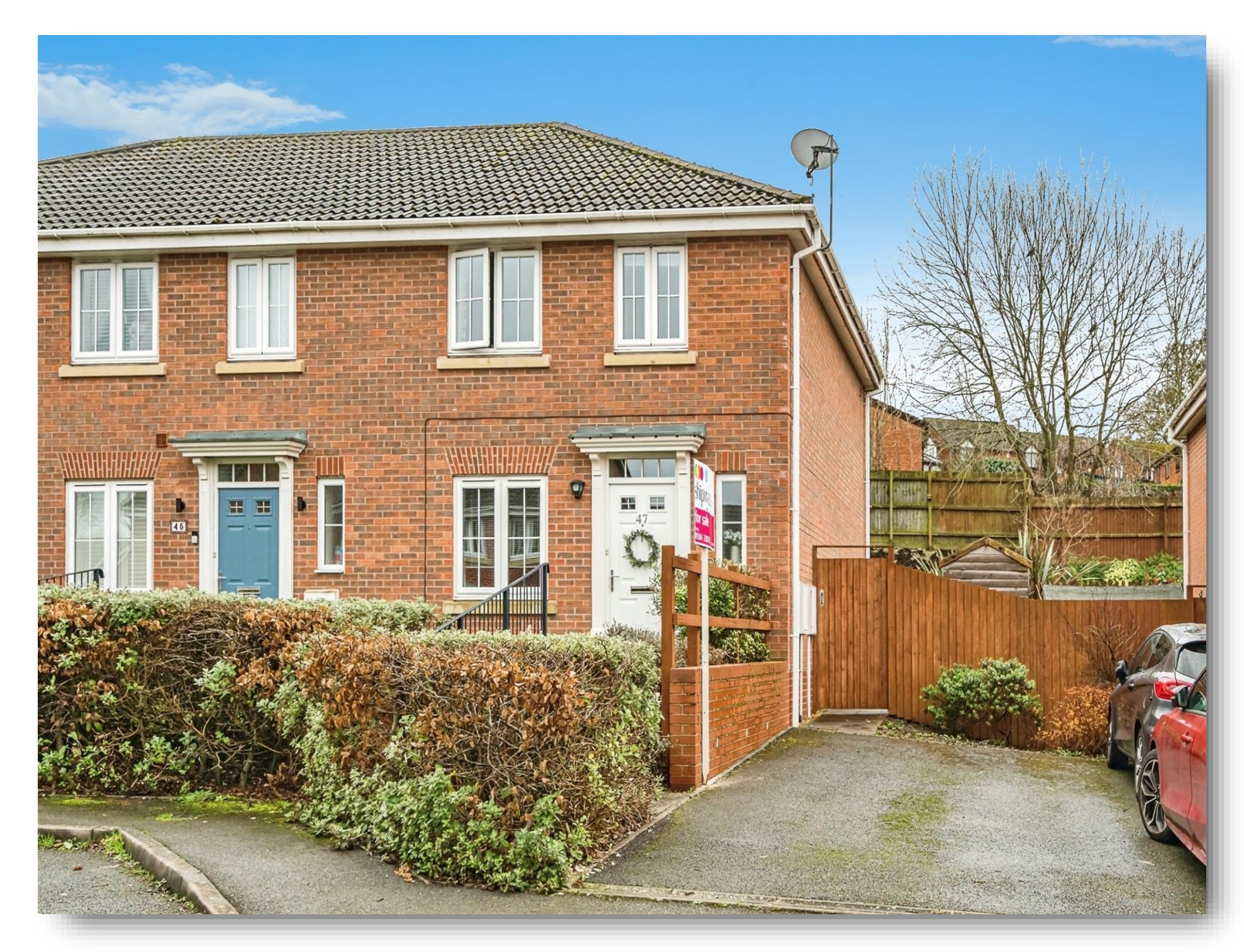
The Breeze, Brierley Hill, DY5 3AG