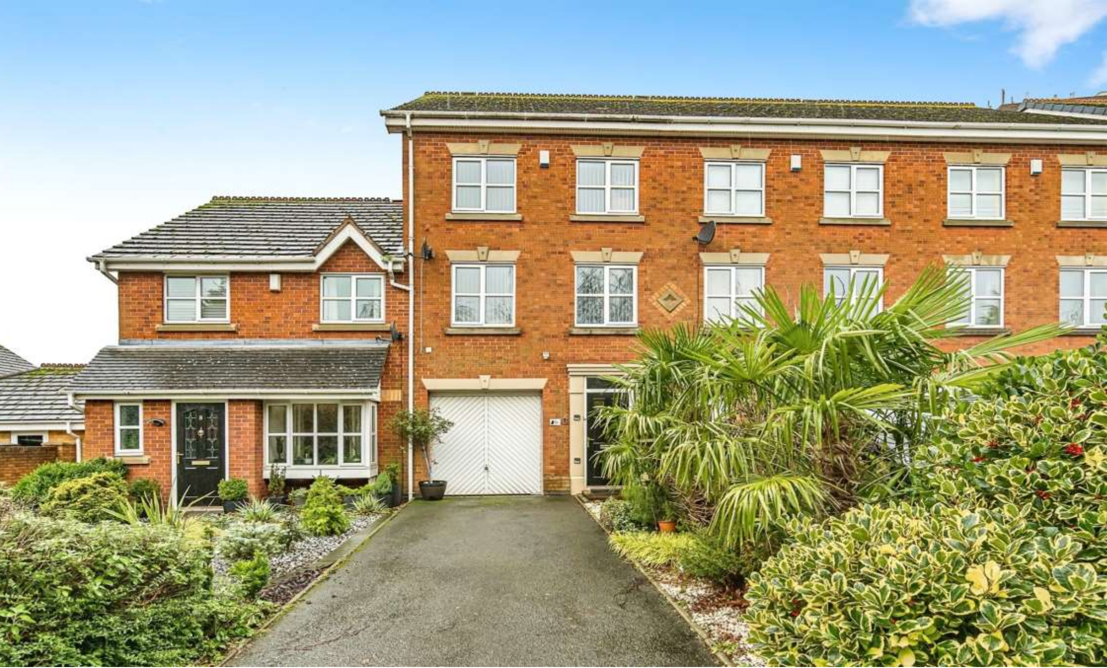
The Shrubbery, Dudley DY1 2BZ