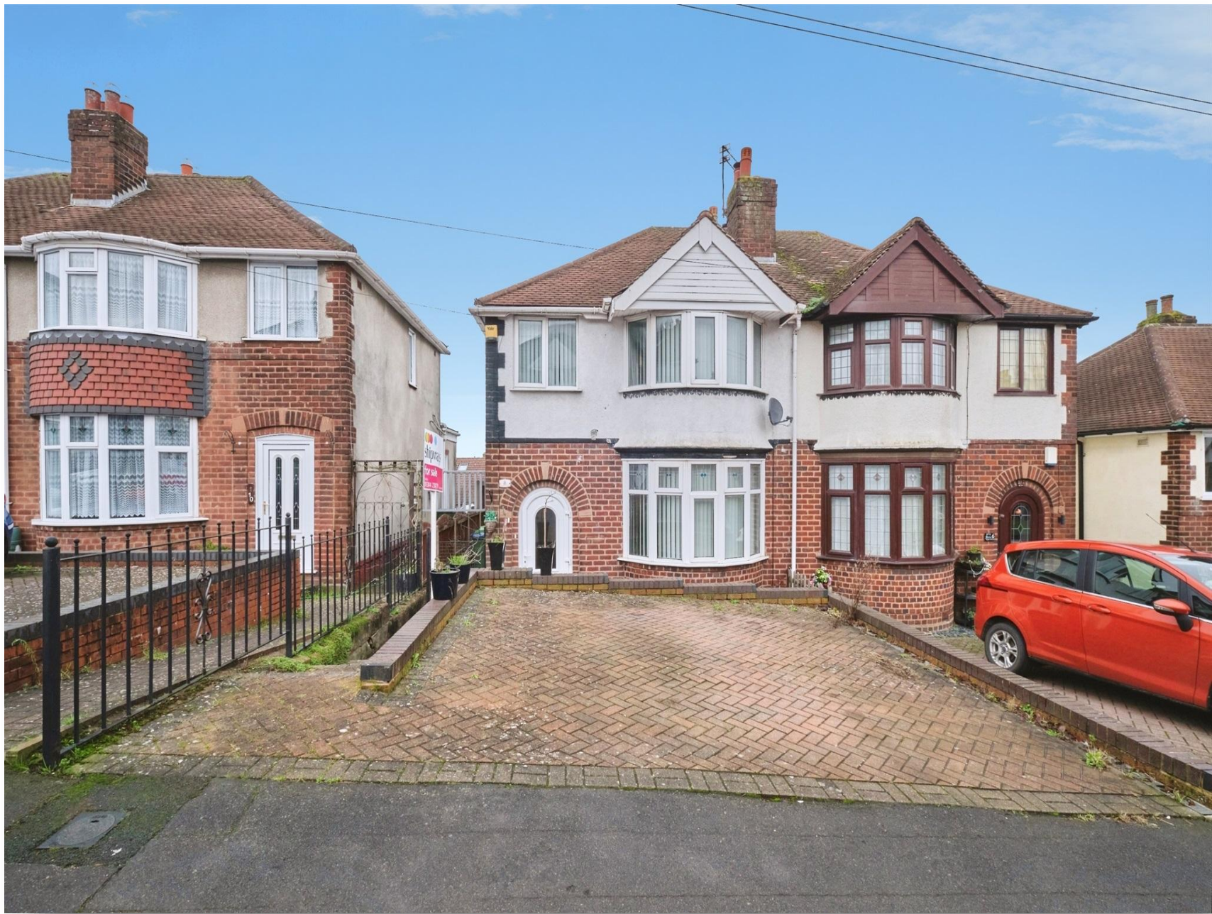
Regent Avenue, Tividale Oldbury B69 1TJ